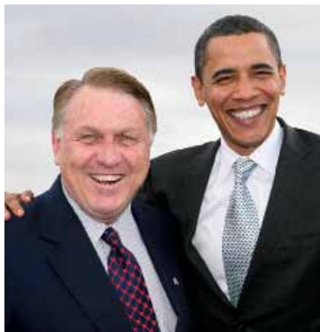
IBT General President James Hoffa and Barack Obama

has been a disaster. Many of our members have suddenly found themselves suffering with foreclosures and the loss of their homes. While Wall Street's bad loans may be getting bailed out, who's bailing out hard-working families who just tried to live the American dream?