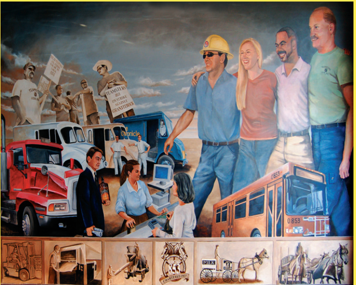
Mural in lobby of Local 853's San Leandro building that celebrates the local's diversity of members and industries.